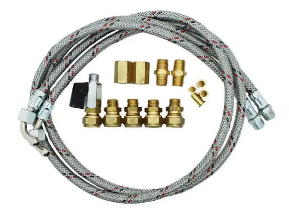
Tigerloop External Fitting Kit (TL6052)

Filtration is more effective, soot build up is reduced and filter life is extended.