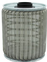
100 Micron Stainless Steel Element